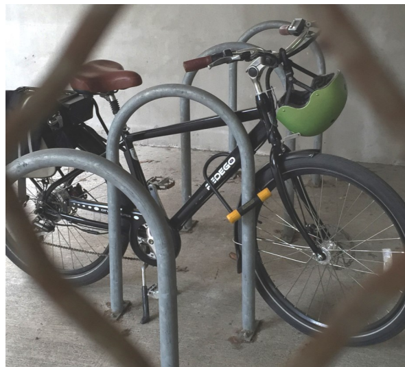
A secured bicycle in the bike parking area

For security reasons, all registered bicycle users must utilize their own personal cable and padlocks/locks to secure their bicycle while utilizing the Secured Bicycle Parking area.