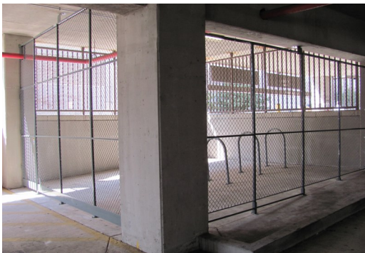
Secured Bicycle Parking Area in Garage Q

All registration shall be processed during regular business hours.